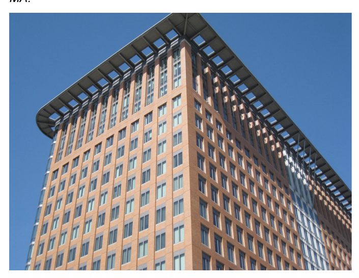
Photo 4: A modern office building with a near-optimal window-to-wall area for energy and daylight performance in Boston, MA

Post Script: The very best in commercial aluminum curtainwall and windows are capable of R6 to R9. There are super windows in research labs with R-values of 10, and even 12 with dynamically operable shading capable of reducing the solar gain to less than 0.10 during bright sun and opening up to 0.60 or more during dull days. Other systems that incorporate light diffusing elements (such as Kalwall and Solera) and phase change materials (such as Glass-X) can reduce energy flows across daylight panels by a factor of ten! Eventually such technology should become more affordable and available, opening up the possibility of high glazing area and high performance.