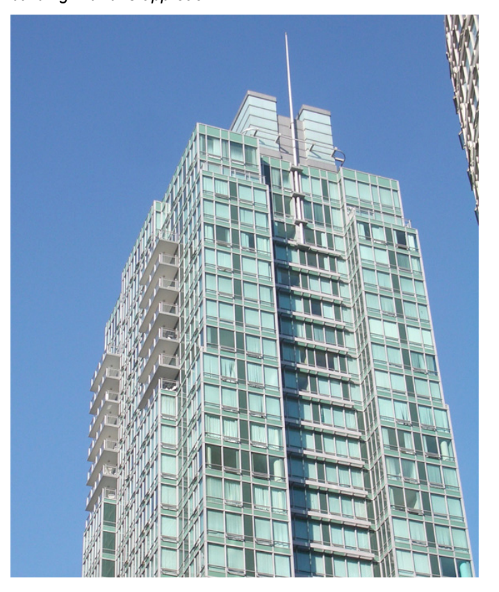
Photo 2 : Almost the entire façade of this condominium tower is covered with low R-value and high solar gain curtainwall. It is almost impossible to achieve a low energy, comfortable building with this approach

How should one choose glazing for green, low energy commercial buildings? At the most basic level, there are three critical measures of performance that must be chosen in design, and specified in contract documents: The U-value (1/R-value), the Solar Heat Gain Coefficient (SHGC) and the Visible Transmittance (VT).