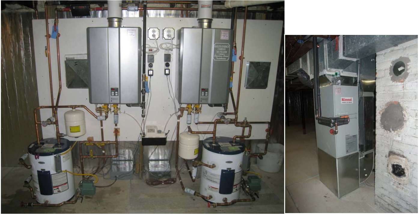
Figure 2. Photos of the two installed systems in Utica, NY with monitoring instrumentation.

BSC's development of this novel combination space and domestic hot water heating system for low energy houses is gaining national attention (ACI, SMUD, etc), and particularly for retrofit projects. This space conditioning system research project is expected to continue through 2011 to track the Utica systems' performance and further inform future potential installations. Appendix B is an email exchange that describes the status of the project at the close of the NETL contract period.