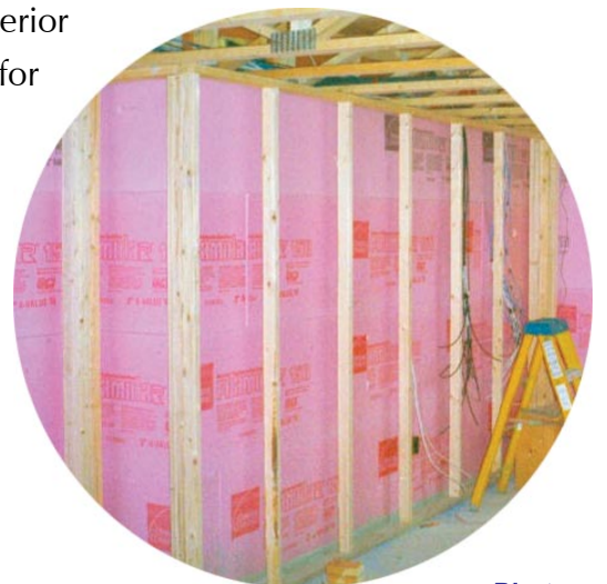
Photograph 1 XPS against basement wall with framed wall