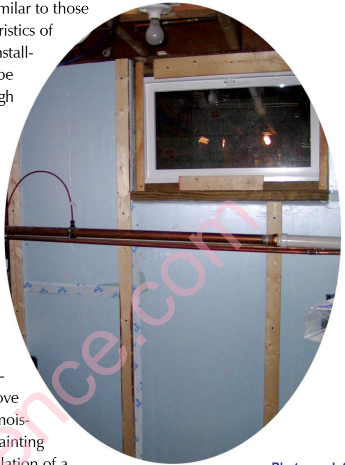
Photograph 2 XPS against basement wall with furring strips

The deep ground temperature of the slab is cooler than the dew point of the basement air. The deep ground temperature under a basement slab is frequently near 55°F throughout the year. Poor interior humidity control or the introduction of exterior air during spring and summer may result in dew points above 55°F. When condensation occurs on unfinished concrete the moisture is quickly absorbed by the concrete and is never visible. Painting the concrete surface or installing thin tile may result in accumulation of a thin layer of water on the surface of the floor.