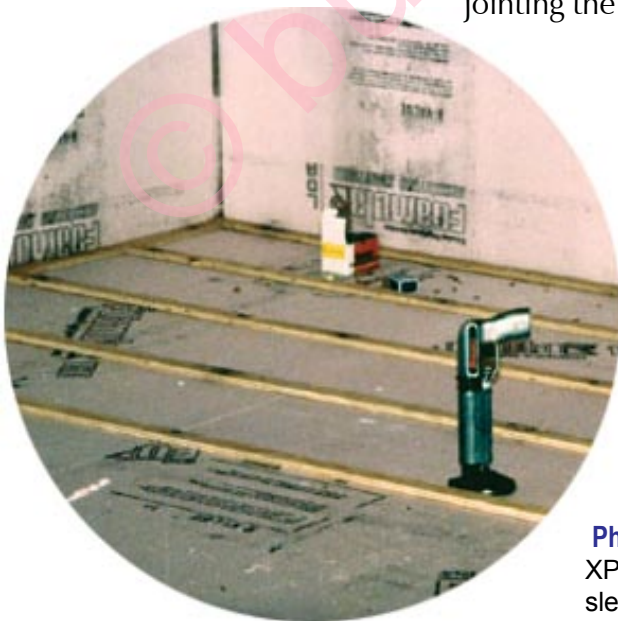
Photograph 3 XPS installed over basement slab; wood sleepers will support plywood flooring

Properly insulating a concrete slab can provide a warm dry surface on which carpet or other flooring can be installed. If a concrete slab is in good repair and does not have significant water problems (liquid water on the surface) sheets of extruded polystyrene can be installed directly on the slab. The joints between sheets should be sealed with tape or mesh imbedded in mastic. A plywood floor can then be “floated” over the XPS insulation in either of two ways. If sufficient room height is available wood sleepers (2X4 or other dimensional lumber) can be installed to which the flooring is mechanically fastened. This is illustrated in Photograph 3 . If room height is minimal, tongue and groove plywood with the butt ends of the plywood joined can “float” above the XPS insulation. Wood biscuits are one method for jointing the butt ends so that one sheet cannot ride up above the next sheet.