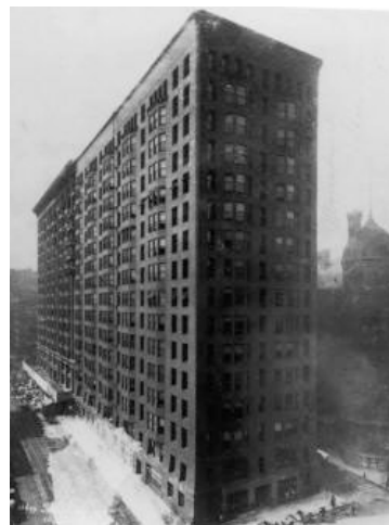
Photograph 2: Monadnock Building ( www.monadnockbuilding.com )

With the change from low-rise buildings with solid load-bearing walls to taller framed buildings, the dead weight and cost of traditional mass wall systems became prohibitive. Chicago's 16-storey Monadnock Building, constructed with 6-foot thick base walls between 1889 and 1891, pushed to the limit the load-bearing mass masonry wall ( Photograph 2 ). Taller buildings with mass walls were practically impossible with the combination of high dead weight and low compressive strength. A large percentage of valuable ground floor area was lost to load-bearing walls and the resistance to seismic loads was poor. Today, poor control of rain penetration, heat, air, and vapor flow can be added to the list of drawbacks.