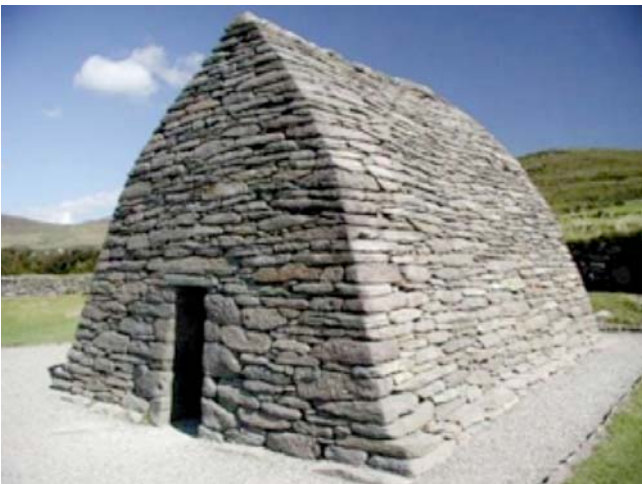
Photograph 1: Traditional mass walls

In traditional mass walls, e.g. a wall of solid masonry or earth, the resistance to rain penetration was only one aspect of enclosure performance ( Photograph 1 ). Heat flow was also controlled by the thermal storage capacity of the massive walls, not just by virtue of the materials' thermal conductivity like the specialized insulation layers commonly used in modern building assemblies. The sun's heat was absorbed, stored, and slowly released to the interior and exterior, effectively damping typical daily fluctuations and thus increasing comfort. Vapor and airflow were also controlled by the mass of the wall. It is little wonder that such walls were used for thousands of years. Built of only brick and