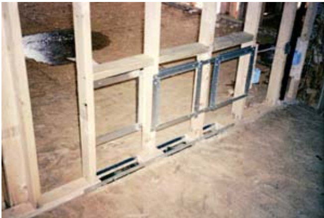
Photograph 7: Sucking on a Wall—Stud cavity return system couples interstitial cavities directly to the HVAC system.