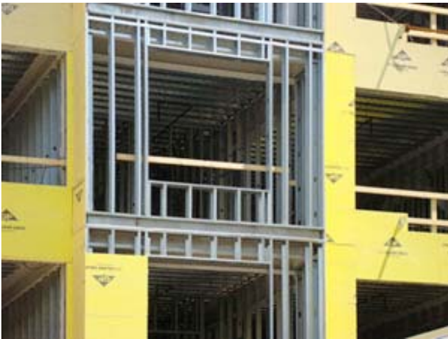
Photograph 6: No Hygric Buffer—Not a lot of moisture storage in hollow steel stud walls sheathed with gypsum.

Do you realize that in the last century, the hygric buffer capacity of the typical building in North America has decreased two orders of magnitude? Those older buildings were like boxers in the '50s that could take a punch – a moisture punch – that they could shake off. A modern building is like a boxer with a glass jaw where a single moisture event puts the building down. Fundamental change number five is that buildings have become complex three dimensional airflow networks that inadvertently couple the building enclosure to the breathing zone of the occupied space via the mechanical system.