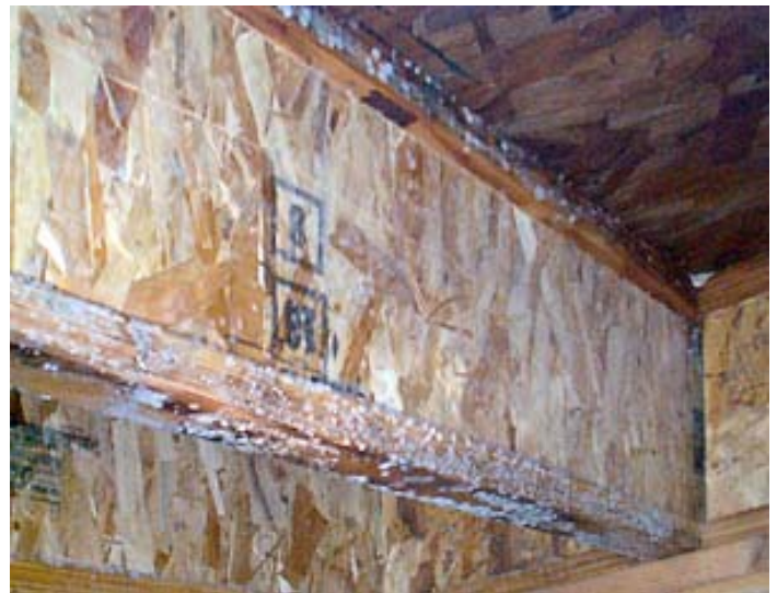
Photograph 4: Mold Sensitive Materials—Engineered wood materials manufactured from OSB and composite wood layers. Mold food par excellence.

of fluffy stuff that provides thermal resistance and then we install a water injection system called a window. 3