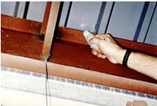
Photograph 9: Sucking on a Wall Part Deux—Commercial return plenum draws air out of exterior walls into the return side of the HVAC system and then subsequently connects to the breathing zone of the occupied space.