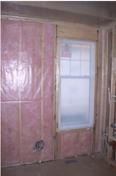
Photograph 2: Impermeable Interior Lining—Polyethylene vapor barrier on the interior of a wood frame wall causing mischief.