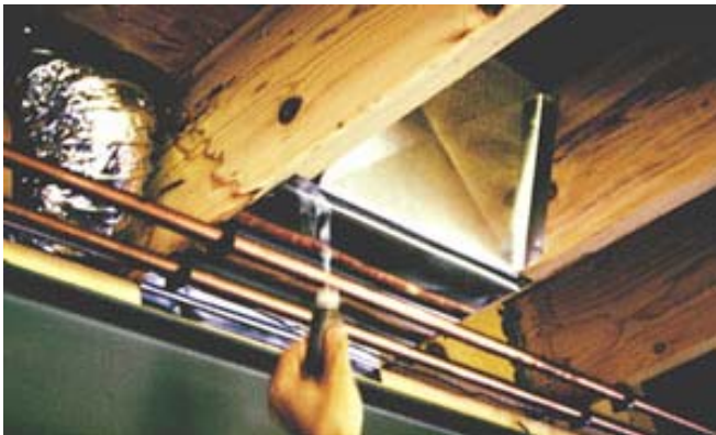
Photograph 8: Sucking on a Floor—Panned floor joist return system couples floor framing directly to the HVAC system.