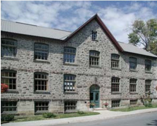
Photograph 5: Big Hygric Buffer—Lots of moisture storage in old mass assemblies constructed from rocks, mortar, bricks and plaster.

– you can't put a vapor barrier on both sides of the assembly. You can put a vapor barrier on one side or the other not both – someone is going to have to make a decision. We can design buildings with vapor barriers on the outside and have them work pretty much everywhere – if we keep them warm during heating or if we drain them. It is much more difficult to design buildings with vapor barriers on the inside – except in cold climates – but we can do it as well.