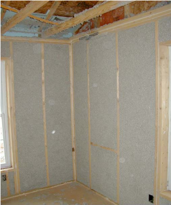
Photograph 1: Increased Thermal Resistance—Lots and lots of thermal insulation in the building enclosure. Spray applied cellulose with insulating sheathing in a wood frame wall.