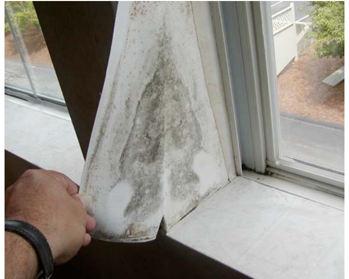
Photograph 3: Vinyl Wallcovering—Bad, very bad, very bad indeed.