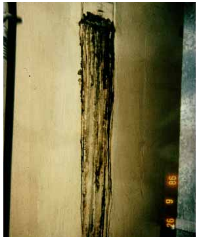
Photograph 5: Condensate Exiting Chimney Clean Out – Big danger here. Old oil furnace is replaced with a new gas furnace. New gas furnace uses existing chimney. Existing chimney is too big. Flue gases cool too quickly leading to condensation of flue gases and freeze up. How to fix this problem? Line the chimney – See Photograph 8.

So here we are 30 years later. Different country. Same physics. Amory Lovins will finally get to make his mark in the country of his birth. Energy conservation in existing homes is about to become serious business in the United States. We now know how to do it right. We