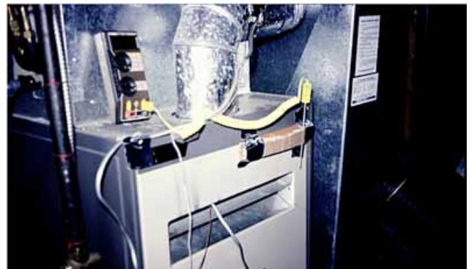
Photograph 7: Spillage of Flue Products – Notice the soot stains at the draft hood of this replacement gas furnace. How to fix this problem? Provide combustion air – See Photograph 9. What are all those tubes and toys you ask? I was once a young graduate student who thought you could measure pretty much anything. Boy was I wrong – and I will leave it at that.