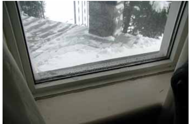
Photograph 4: Window Condensation - Interior moisture levels go up due to reduced air change and relative humidity adjacent cold window surfaces rises sufficiently to condense water. How to fix this problem? Lower the moisture content of the interior air with dilution ventilation or warm up the surface of the windows by replacing the windows with better windows or do both.