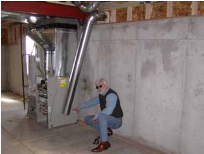
Photograph 9: Combustion Air Supply – Handsome guy with sunglasses (not me, but an ex classical concert musician who knows stuff about buildings) is pointing at a ducted (to the outside) combustion air supply duct. As handsome as he is wouldn't it be better to have sealed combustion power vented appliances and not have to worry about providing a duct like this?