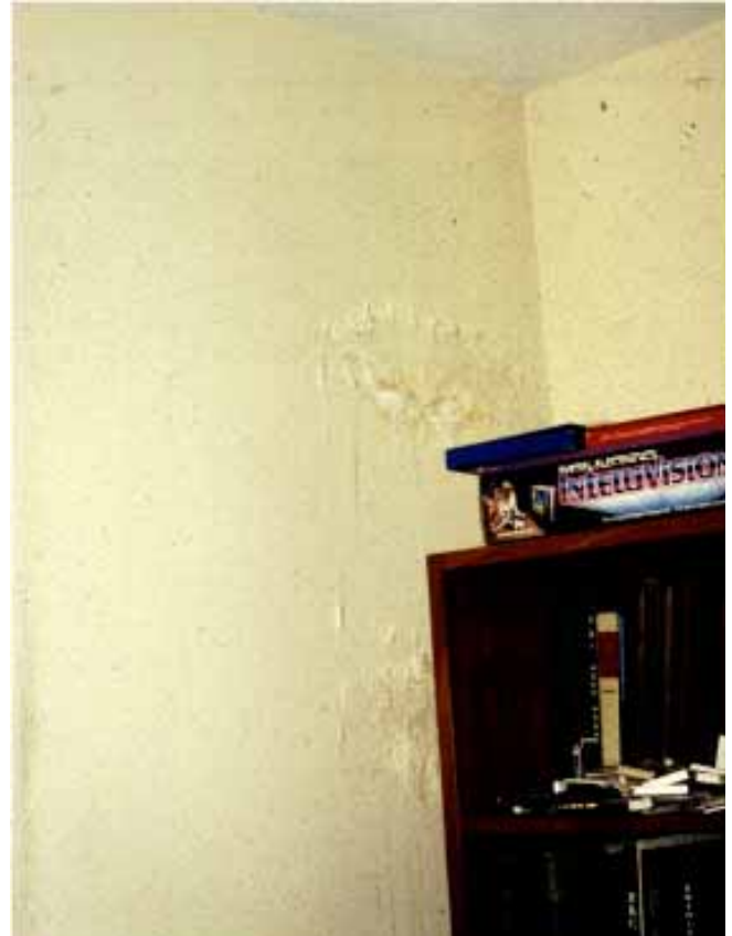
Photograph 6: Flue Condensate Damage – Big danger here. Condensate from flue gases from replacement gas furnace leaching through wall assembly. How to fix this problem? Line the chimney – See Photograph 8.

Then air-tighten and insulate to your hearts (and budgets) content. Notice the order. We do the stay out of trouble part first. Then we caulk. Then we insulate. All this sets the stage for what will inevitably come later. There will be more energy conservation to follow, not less. If we get these first priorities out of the way, there is no way that we will screw up what comes later. The later order and the later technologies won't matter. Think of the outcome. No houses rot this time. No one gets sick. We save energy. Life is good.