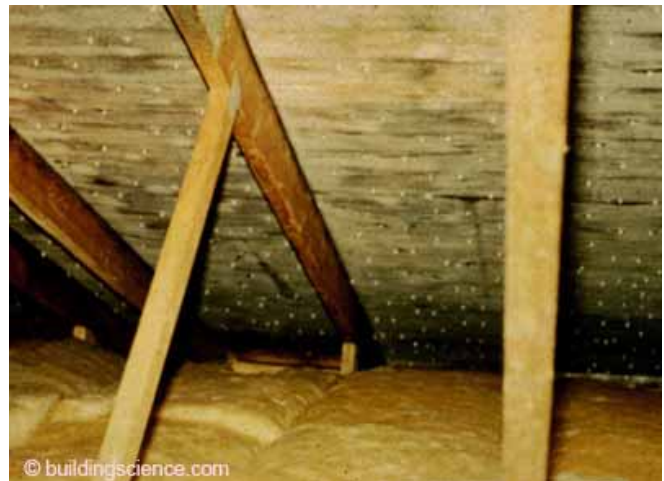
Photograph 1: Moldy and Decaying Attic – Notice the frost on the nails penetrating the roof sheathing. Moisture ends up on the coldest surfaces first. The sheathing is taking a beating, but the top chords of the roof trusses are doing fine because they are just a little bit warmer.

The final bit of good news for the old leaky poorly insulated attic was the presence of a chimney. And not just any chimney, a big, hulking masonry chimney connected to a big oil furnace. Lots and lots of air was sucked out of houses with these chimneys. Think of this old type of chimney as a powerful exhaust fan that served to depressurize the enclosure and provide air change. The air change diluted interior moisture levels and the depressurization raised the neutral pressure plane reducing the amount of exfiltration into the attic. Many old timers viewed these chimneys as the ultimate ventilation system – an exhaust fan that never burned out.