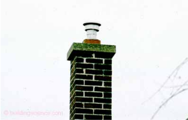
Photograph 8: New Chimney Liner – notice the new smaller sheet metal flue installed inside the larger original masonry chimney that served the older oil furnace that got replaced.