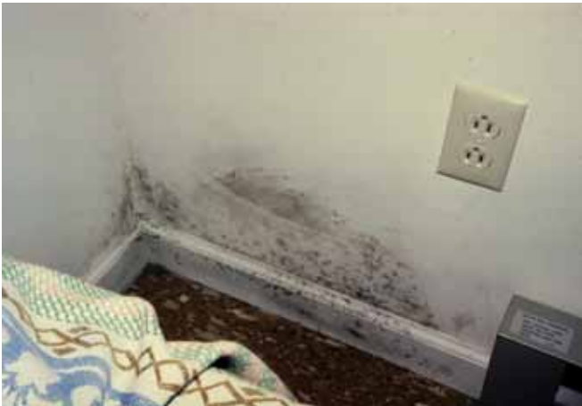
Photograph 2: Mold on Interior Surfaces – Interior moisture levels go up due to reduced air change and relative humidity adjacent cold surfaces rises sufficiently to support mold growth. Compare this mold growth pattern to the temperature profile in Photograph 3.