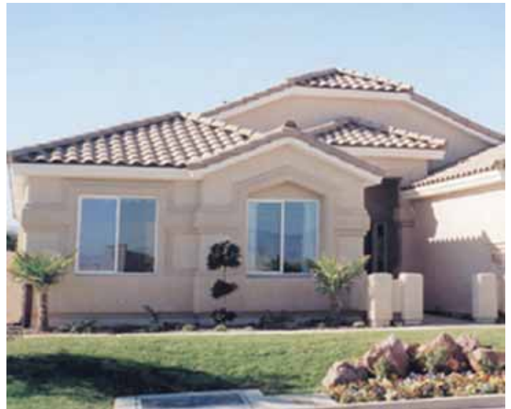
Photograph 1: Las Vegas Home —Stucco, tile roof, in a subdivision in the middle of the desert.