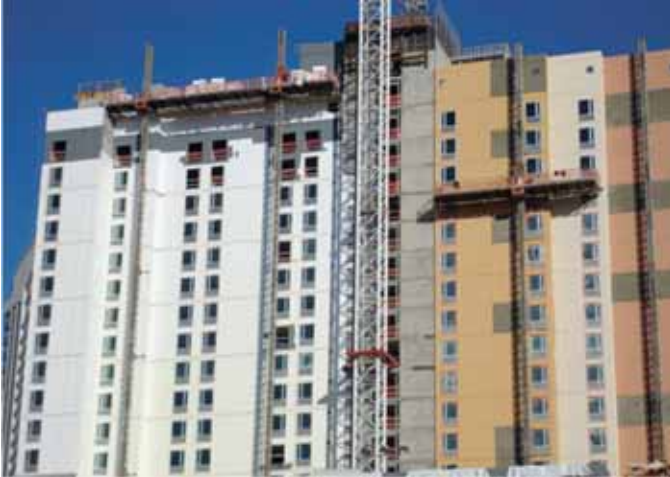
Photograph 5: More Las Vegas Stucco —Concrete frame, steel stud backup walls sheathed with paperless gypsum. Exterior insulation is EIFS. Thermal resistance is nominally R-20.