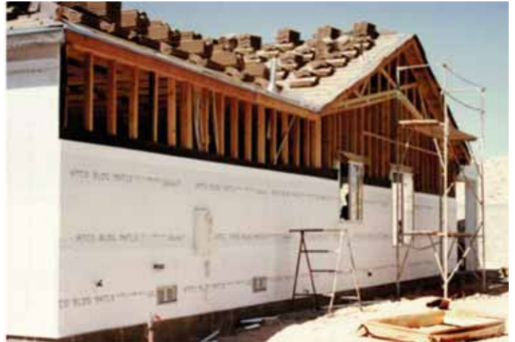
Photograph 3: Under the Las Vegas Stucco —Wood frame (2×6) externally insulated with expanded polystyrene installed over a drainage plane. Thermal resistance is nominally R-25. Tile roof is installed over unvented conditioned wood frame insulated assembly. Thermal resistance is nominally R-35.

In Vegas, residentially, we see lots of stucco installed over exterior insulation, over insulated wood frame structures ( Photograph 3 ). In Dubai, residentially, we see lots of stucco installed over uninsulated masonry walls ( Photograph 4 ). Roofs in Vegas are tile with light-colored membranes over insulated wood truss assemblies ( Figure 1 ). Roofs in Dubai are tile with light-colored membranes over uninsulated concrete slabs