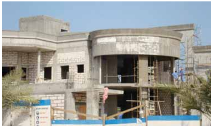
Photograph 4: Under the Dubai Stucco —Concrete masonry units are not insulated. Thermal resistance is nominally R-8. The roof membrane is installed over an unvented, uninsulated conditioned concrete slab. Thermal resistance is nominally R-8.

( Figure 2 ). Windows in Vegas are nonconductive vinyl and wood-framed, low-E2 gas-filled glass. Windows in Dubai are conductive aluminum, single-pane tinted glass. Air conditioners in Vegas are small and efficient. Air conditioners in Dubai are huge and not efficient. Residential construction is “tight” in Vegas with controlled ventilation. Residential construction in Dubai is also “tight” but with no provision for controlled ventilation beyond that of operable windows.