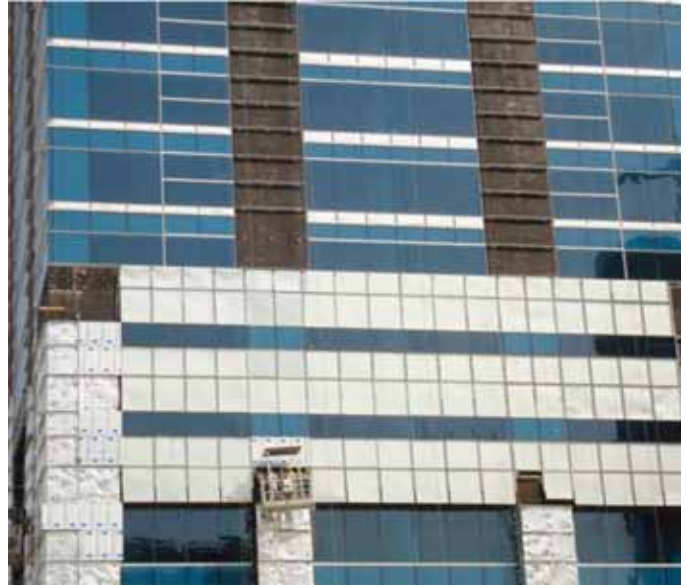
Photograph 7: Typical Dubai curtain Wall —The curtain wall is pretty much an uninsulated cladding that is installed over a CMU backup wall that is externally insulated with foil-faced rock wool. Note that the CMU is coated with a liquid-applied dampproofing. This is a good start. However, the liquid-applied dampproofings commonly used in Dubai are too thin to do much of anything. They don't do much for the rain control (but there is not much rain to worry about in Dubai). The key is that they are not effective air barriers as the assemblies are too air porous, and air barrier continuity is missing at punched openings (this is a big deal). This pretty useless thin stuff could easily be replaced with a "for-real" drainage plane/air barrier membrane (liquid applied) coupled with some minor detail changes at the punched openings. This change would be huge. Now, if you want to save costs, the CMU backup wall could be replaced with a steel stud wall with exterior paperless gypsum board. Think of the weight and resources saved? This configuration would actually be better than most curtain walls in Vegas, London, and New York. Oh, yeah, I almost forgot—the window area should be reduced, but you all knew that.

Which makes more sense in an unbelievably hot climate: commercial construction in Vegas or Dubai?