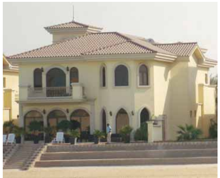
Photograph 2: Dubai Home —Stucco, tile roof, in a subdivision on a man-made sandbar in the middle of the Persian Gulf surrounded by desert.

it is an afterthought that is “kludged” onto the project design after the primary architecture and engineering is complete. Sound familiar? 4