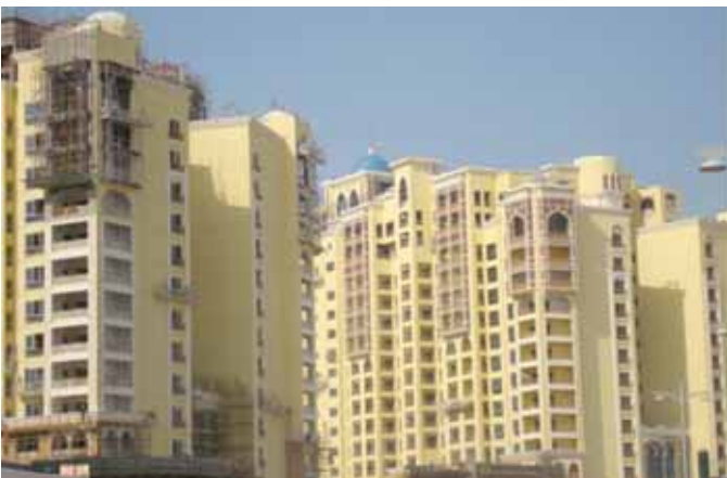
Photograph 6: More Dubai Stucco —Concrete frame, masonry backup wall has direct-applied exterior stucco. Thermal resistance is nominally R-8.