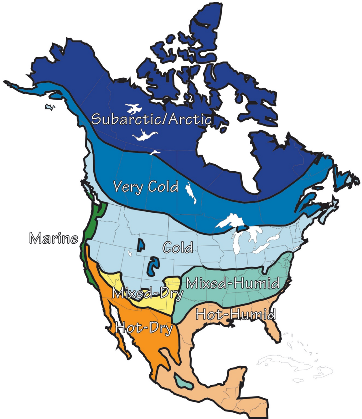
Figure 1: Hygro-Thermal Regions – Based on Herbertsons’s Thermal Regions and Koppen climate types