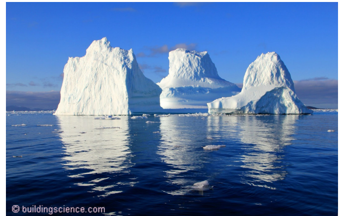
Photograph 4: Icebergs - When salt water freezes the salt is left behind that is why ice-bergs do not have salt in them.

The planet is covered by oceans. The oceans are filled with salt. When salt water freezes the salt is left behind. That is why icebergs ( Photograph 4 ) do not have salt in them. 2 The salt concentration of the surrounding ocean goes up when the salt water freezes.