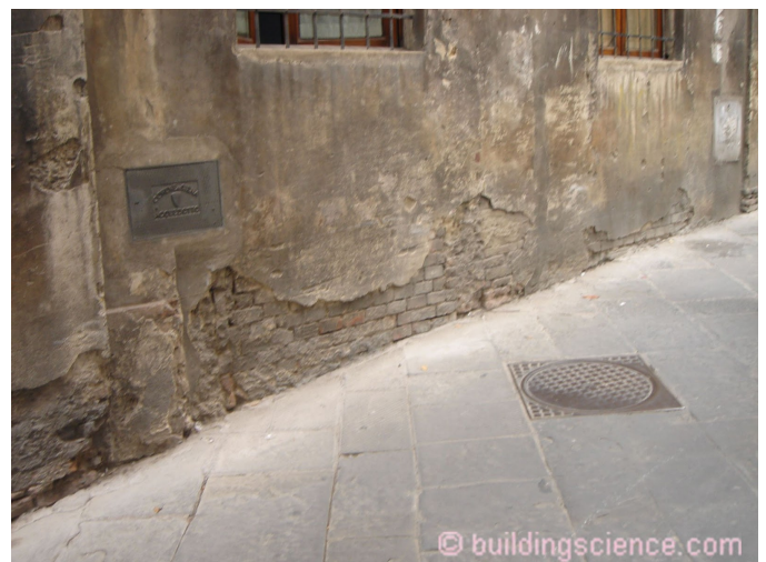
Photograph 2: Spalling – Water changes from a liquid to a vapor.