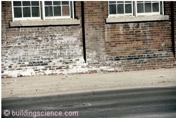
Photograph 3: Efflorescence – Water changes from a liquid to a vapor.

Freeze-thaw damage does not occur because when water freezes its volume increases by 9 percent. Note that the water does increase in volume, but this is not what leads to the freeze-thaw issues. Let me repeat, this change in volume is not what leads to freeze-thaw issues. 1